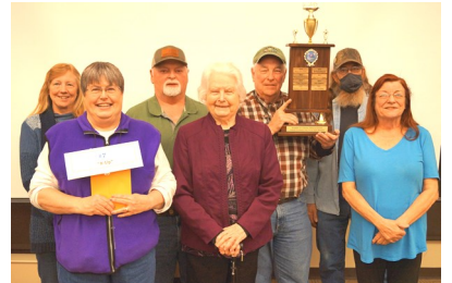
2nd Place The Old Timbers