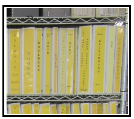
Family binders on the shelves at KCHS. Help expand our collections of family histories.

NOTE: Birth certificates, death certificates, and marriage records are available from public sources and do not need to be brought for scanning.