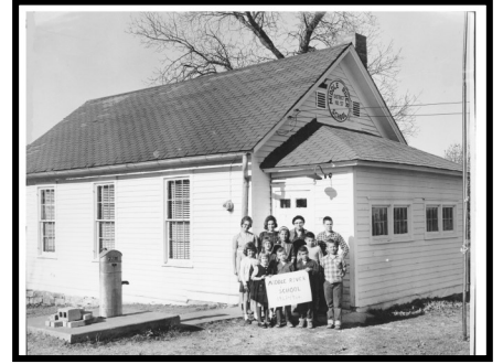
Middle River School 1963

Deadline for submission is November 30, 2022.