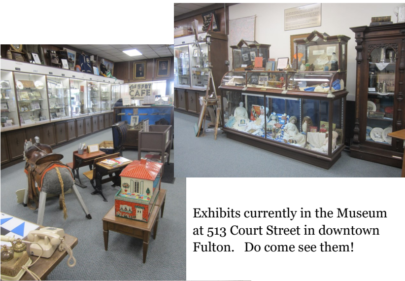
Exhibits currently in the Museum at 513 Court Street in downtown Fulton. Do come see them!