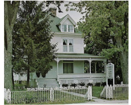
The Tuttle House at 7th Street and Westminster Avenue

Today the Museum and Research Center, added in 2019, are staffed by approximately 16-18 volunteers who help each week and two part-time staff people. Hours are 10-4 Tuesday through Friday, and the first Saturday of each month from 10-2:00.