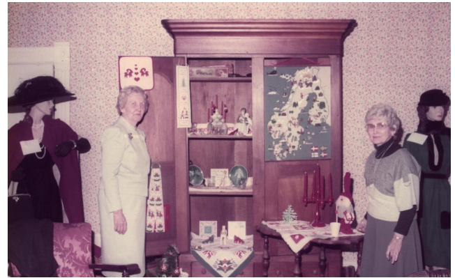
Volunteers with an exhibit at the Tuttle House Museum (circa 1970's).