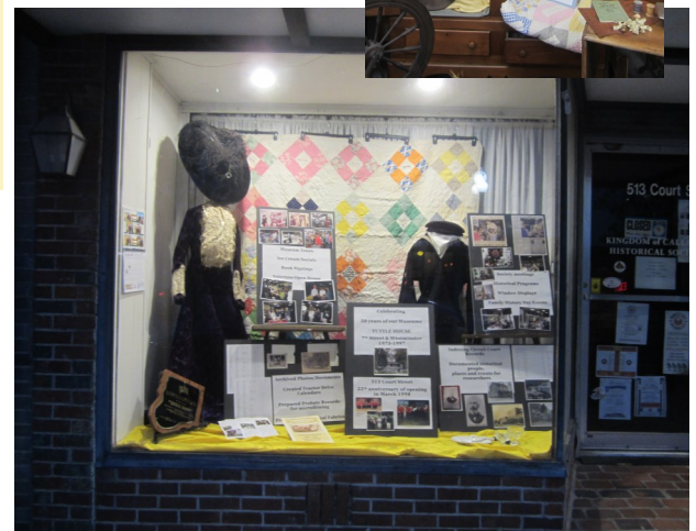
Current Museum window on Court Street highlighting our 50 years. It will be there until May 31.